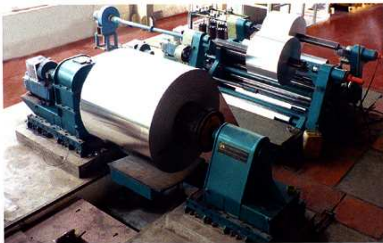
■ (Foil slitters and Cutting machine)

Six units of 1450mm, 1850mm Foil slitters and Cutting machine can cut the foil coil into different specification, according to the demand of the customers.